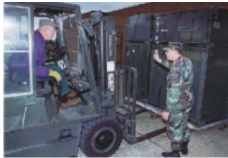
Cooperation between civilian and military agencies is critical in MOOTW.

It is rare that the military will be the sole, or even the lead, agency in MOOTW. Some operations will, by their nature, be predominantly military. In most situations, however, the military will be one agency of many. As is common in low-intensity conflicts, military forces will often find themselves supporting the other instruments of national power. While unity of command is critical within the military forces, most MOOTW will demand unity of effort among a wide range of agencies to ensure that they focus and coordinate their resources on the same goal.