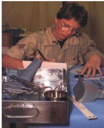
Medical units often participate in emergency humanitarian efforts over-seas.

The Air Force possesses many capabilities that can aid in the consequence management efforts of other US, host nation, and nongovernmental organizations. Air Force units such as medical teams or civil engineers can respond rapidly to emergencies and provide critically needed support to relieve immediate suffering and assist the host government in beginning its long-term reconstruction effort. Support from air mobility, security, and communications forces, among others, greatly enhances the ability of Air Force, joint, and multinational organizations to conduct this type of mission. Other aerospace contributions can come from Air Force intelligence surveillance, and reconnaissance or search and rescue capabilities. Detailed guidance is available in JP 3-07.6, Joint Tactics, Techniques, and Procedures for Foreign Humanitarian Assistance .