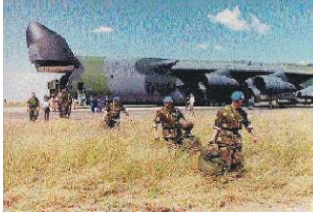
Finnish soldiers on a UN peacekeeping mission exit a USAF C-5. Even when the US does not provide ground forces, American air mobility often supports peace operations.

defense and protection of resources. They conduct their operations in an open and highly conspicuous manner. Their main purpose is to establish a presence which inhibits hostile actions by the disputing parties and bolsters confidence in the peace process.