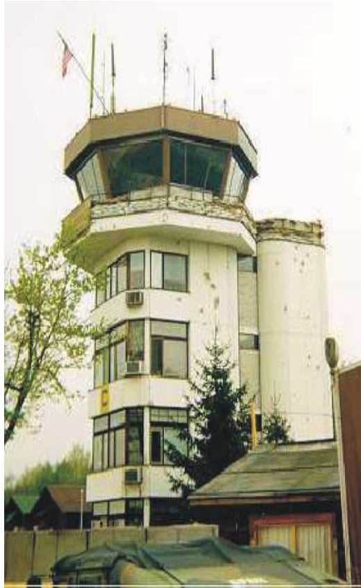
C2 systems may use existing facilities.

with existing host-nation communications or allied C2 systems presents both a challenge to communications units and an opportunity to leverage scarce deployable US resources. Regardless of what C2 system is used, it is needed from the initial planning stages through redeployment. A broad range of options are available for using C2 systems during MOOTW. These options may range from providing radio equipment to assisting a nation or friendly force by improving its field communications or providing a deployable air traffic control system. In addition, these options may include extensive C2 upgrades for command posts, communications infrastructure, or intelligence, surveillance, and warning sensors, as well as various communications and information collection and processing systems. Mobile and fixed-site equipment can be used. AWACS aircraft, as well as airborne command posts, may be deployed to the area of operations to provide the overall control structure. Satellite communications resources may be used in areas where long-range communications are required.