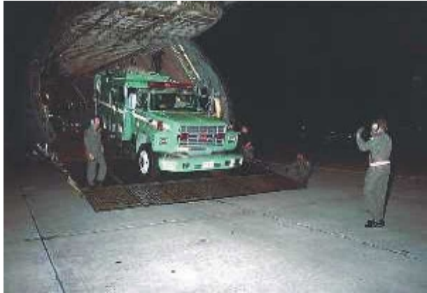
Air mobility forces supported efforts to fight forest fires in Florida in 1998.

Military forces may provide limited support to civilian law enforcement agencies, but these activities are subject to many legal restraints. This support may include such things as training for law enforcement agencies, assisting in the control and resolution of a civil disturbance, or providing resources to prevent or mitigate the threat of a nuclear, biological, or chemical (NBC) terrorist threat. Military forces are not allowed to enforce the law except in two specific circumstances: